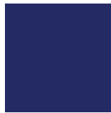
DHA Dark Blue RGB: 36/43/100 CMYK: 100/95/28/23 HEX: #092068