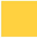
DHA Yellow RGB: 255/208/65 CMYK: 69/8/100/0 HEX: #FFD041