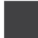
DHA Gray RGB: 65/64/66 CMYK: 0/0/0/90 HEX: #414042