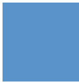
DHA Blue RGB: 90/146/202 CMYK: 65/34/2/0 HEX: #5A92CA