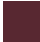
DHA Maroon RGB: 88/40/49 CMYK: 45/82/61/52 HEX: #582831