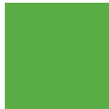
DHA Green RGB: 90/172/69 CMYK: 69/8/100/0 HEX: #5AAC45