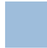
DHA Background Blue RGB: 158/189/219 CMYK: 37/16/4/0 HEX: #9EBDD8