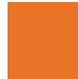
DHA Orange RGB: 234/116/37 CMYK: 4/67/99/0 HEX: #EA7425